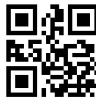
Hubert HO International Commissioner

Scout members can download this document here or by scanning the QR code below.