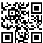
Hubert HO International Commissioner

Scout members can download this document here or by scanning the QR code below.