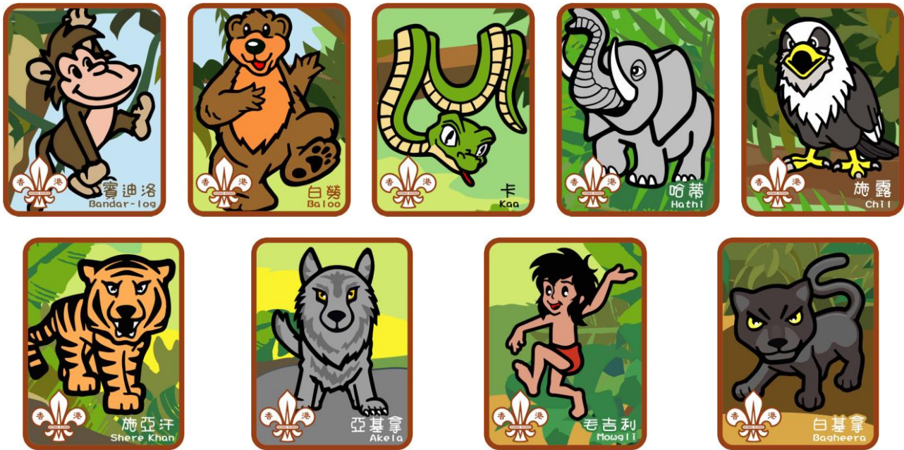
A set of 9 badges, each measuring: 6.4 cm (W) x 8.4 cm (H).

We hereby announce that the Badge Set will be available in limited quantities and costs HK$38 each. Interested parties can buy that Badge Set at The Scout Shop of Hong Kong from now while stocks last.